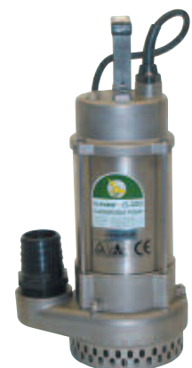
JS-400 STAINLESS STEEL