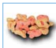
MEAT - FISH & ANIMAL FOODS